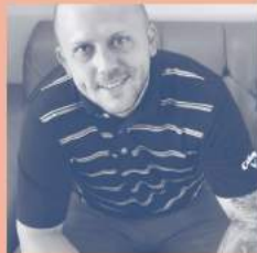
DEEDE MOGCK Children & Youth Services, Serving 42 years

"Once we are past that exterior, we are often met with stories of pain, hurt, loss and trauma. But we also get to see hope, resilience and determination."