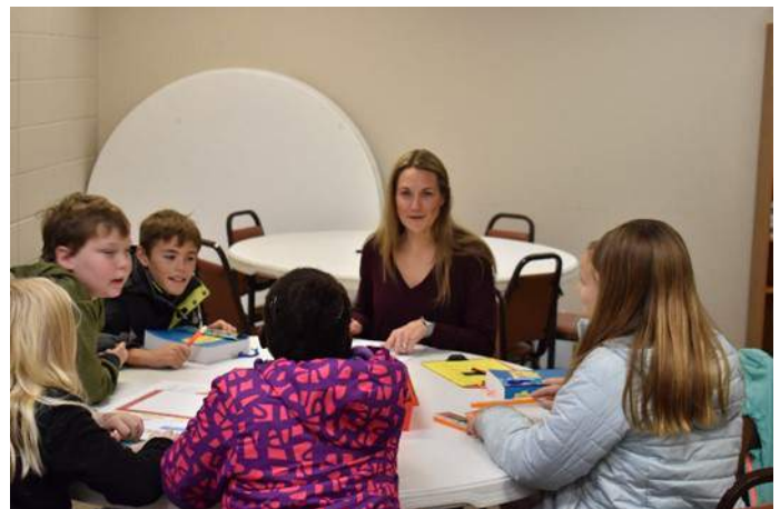
^^^ 10:10 4 th -5 th grade Class