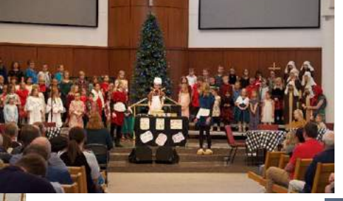
^^^ 2023 Christmas Musical <<< 2023 VBS 2023 Wed night 4/5th grade tie blankets >>>

Director of Faith Formation Children, Early Teens & Family